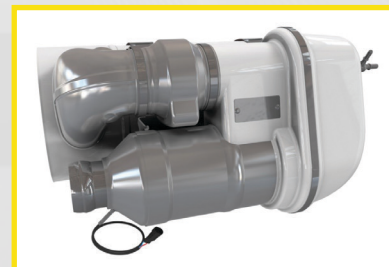
Diesel Particulate Filter