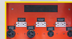
Auxiliary Outlet Panel